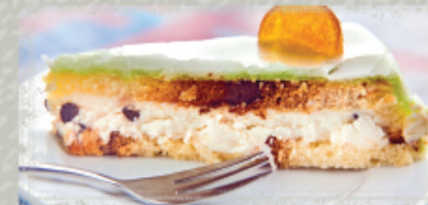
Cassata Siciliana (G, L) - €4.85