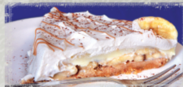
Banoffee Pie (G, L, N, E) - €4.85