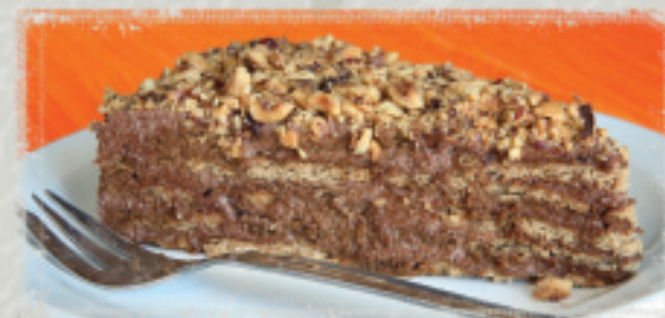
Gateau Marie (G, L, N) - €4.85