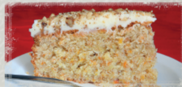
Carrot & Walnut Cake (G, N, E) - €4.85