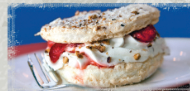
Strawberry Meringue (E, L, N) - €4.85

Important - The following are indications of food allergens that some dishes may contain. Should you have any dietary requirements or suffer from any allergens, kindly inform a member of our staff when your order is being taken.