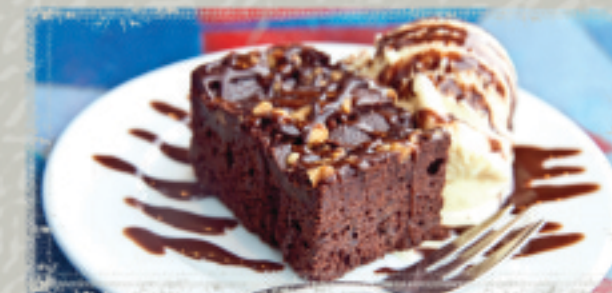
Warm Chocolate Brownie with Ice Cream (G, L, N) - €4.65