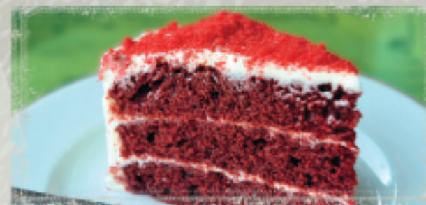
Red Velvet Cake (G, L, N, E) - €4.85