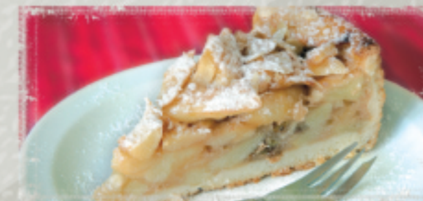
Apple Pie (G, L, N, E) - €4.85